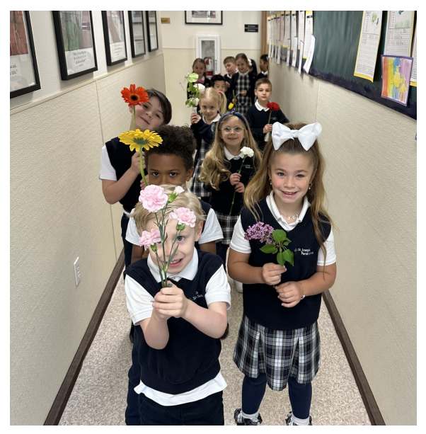
Students on their way to May Crowning